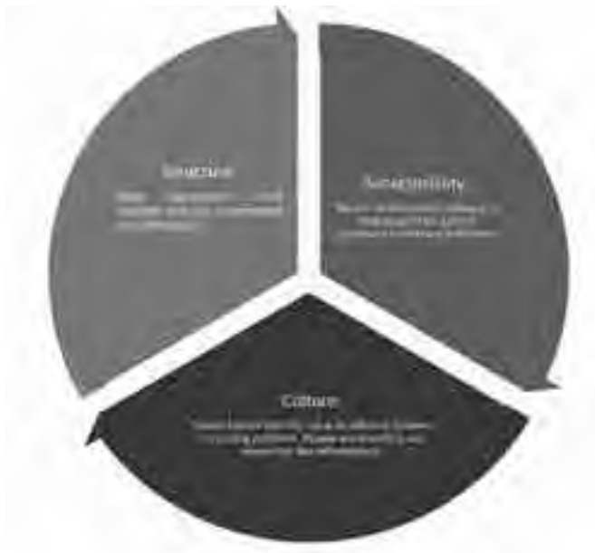
Grafik 1 Legal Conditions in Normal Situations

The above mentioned condition definitely is quite different from legal situation in normal condition. In a normal situation law enforcement function effectively, law enforcement agencies work as normal and there is no centralized law enforcement or they are always accompanied by checks and balances and multi-levelled system. In normal circumstances there is no Subversion Act, military law or emergency law. The public trust legal process to resolve emerging problem or conflict.